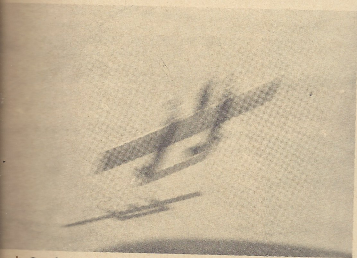
See what we mean by extra zip, model appears ready to loop on take-off.