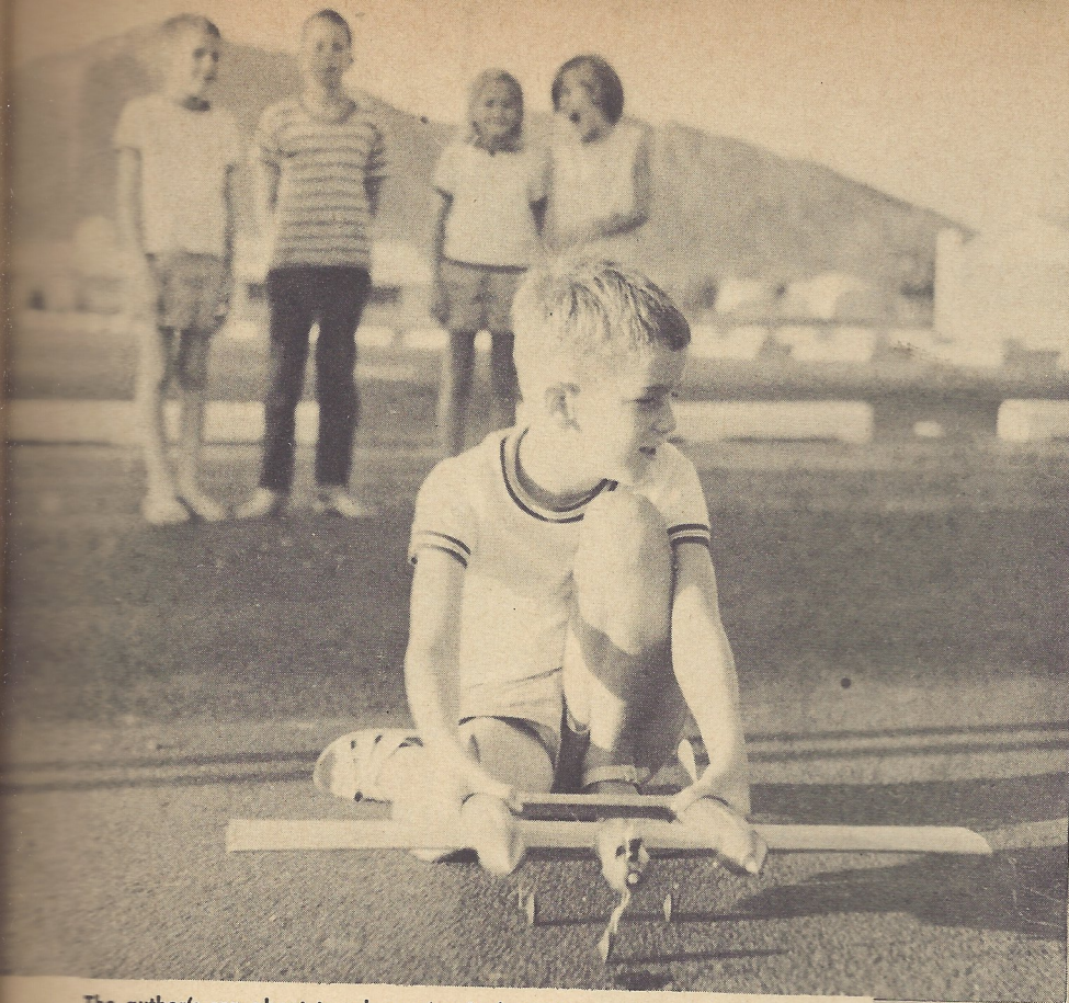
The author's son about to release the single engine version of the Two-Tube. Youngsters in the background are really enjoying the flying show.